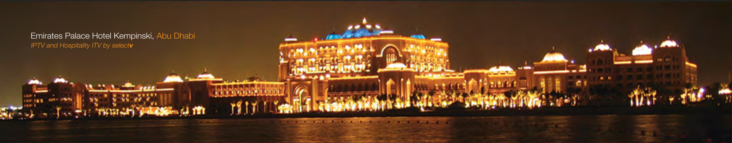
Emirates Palace Hotel Kempinski, Abu Dhabi IPTV and Hospitality ITV by selectv